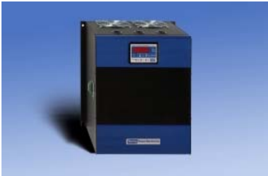
853 Digital SCR Power Controller

Convinced of tangible benefits from the controls upgrade, the Customer isolated the process, conducted comparative process measurements and calculated the cost benefits from the use of the Spang 853 Digital Power Controllers . The result.....over $2000/mo. savings which justified a three month payback on the investment!